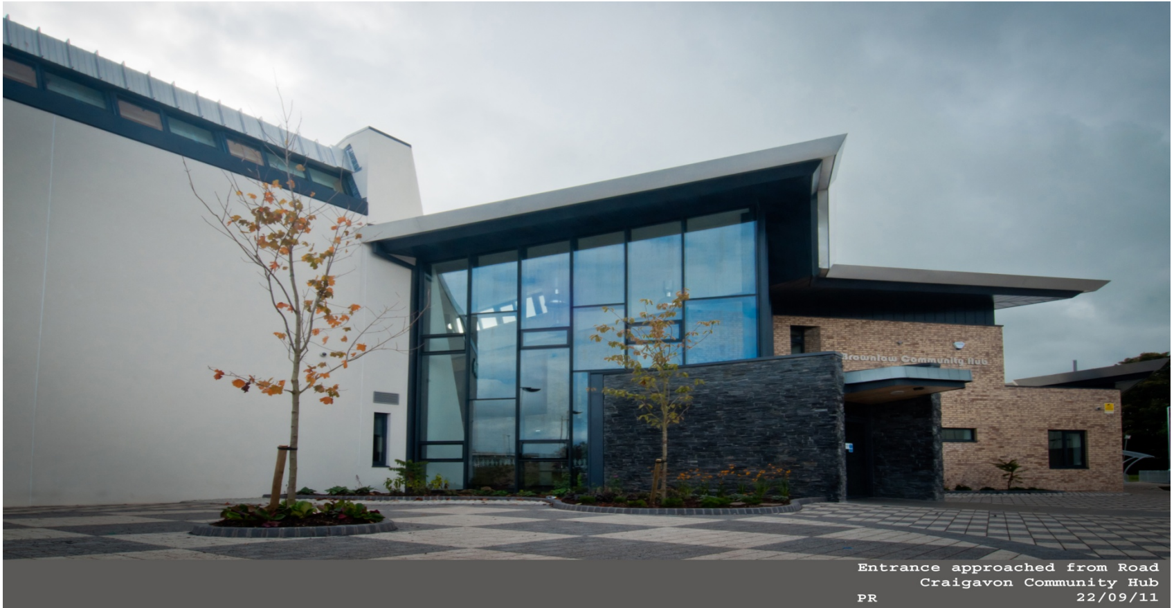
Entrance approached from Road Craigavon Community Hub PR 22/09/11